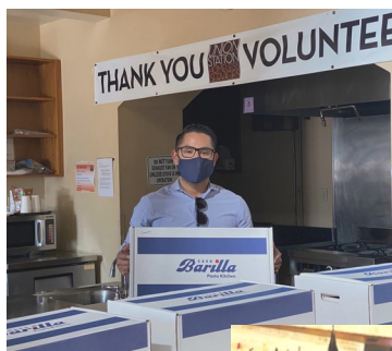
Barilla America Restaurant Group Sponsored the March Adopt-A-Meal Dinner