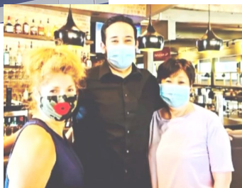
Hill Street Café Sponsored the April Adopt-A-Meal Dinner